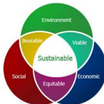
Figure 1: Models of sustainability for the health and care sector